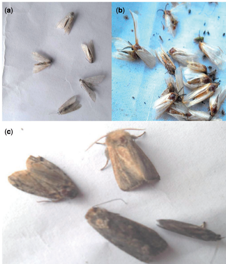
Fig. 1. Lepidopterous stem borers trapped during survey: (a) C. partellus , (b) M. separatella , and (c) S. calamistis .

In all of four study locations, stem borer larvae were more aggregated along the edges of rice fields than in the middle parts (Fig. 2). Among these wards, Chela had the highest number of larvae followed by Ngaya and Kashishi while Bulige had the lowest (Fig. 2).